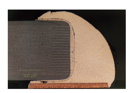
Section through a test setup of a ceramic multi-layer capacitor soldered on a FR-4 testboard.

In addition to the large number of services they provide, our development department is also closely involved in the conversion of printed circuit board production to "lead-free" technology. This has meant initiating numerous cooperation projects with well-respected partners and customers. The practical implementation of our employees' technological know-how and the utilization of the findings from our fundamental