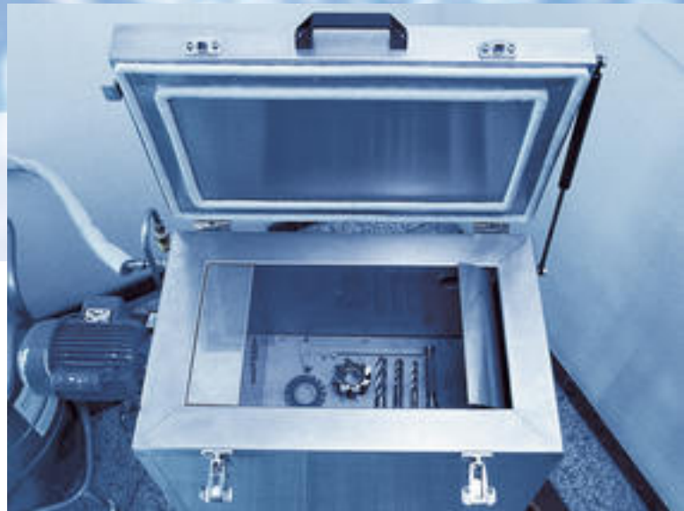
Controlled cooling of steel parts in a cold chamber.