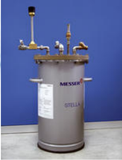
The subcooler increases the cooling quality of the nitrogen.