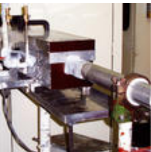
Inner hose cooling