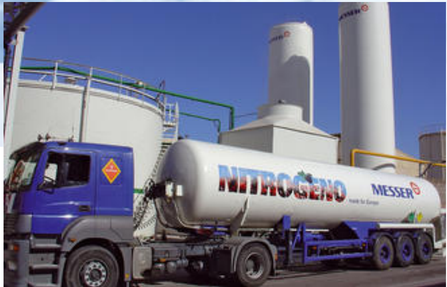
The nitrogen is stored in specially insulated tanks.