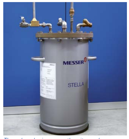
The subcooler improves the nitrogen's refrigerating qualities.