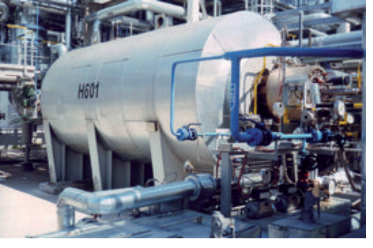
A targeted O_2 supply increases the efficiency of cracking units.