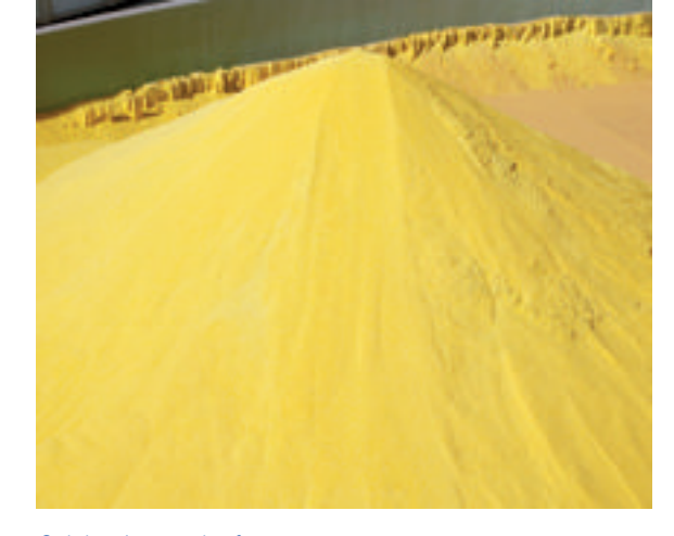
Sulphur in powder form

Working together with operators of waste sulphuric acid cracking plants, Messer has developed safe and reliable methods of injecting oxygen into the various cracking reactors under production conditions. Oxygen can be used to increase the efficiency of any waste sulphuric acid recycling process that involves the use of thermal reactors (Grillo process, Lurgi/Stauffer process, fluidised bed reactors).