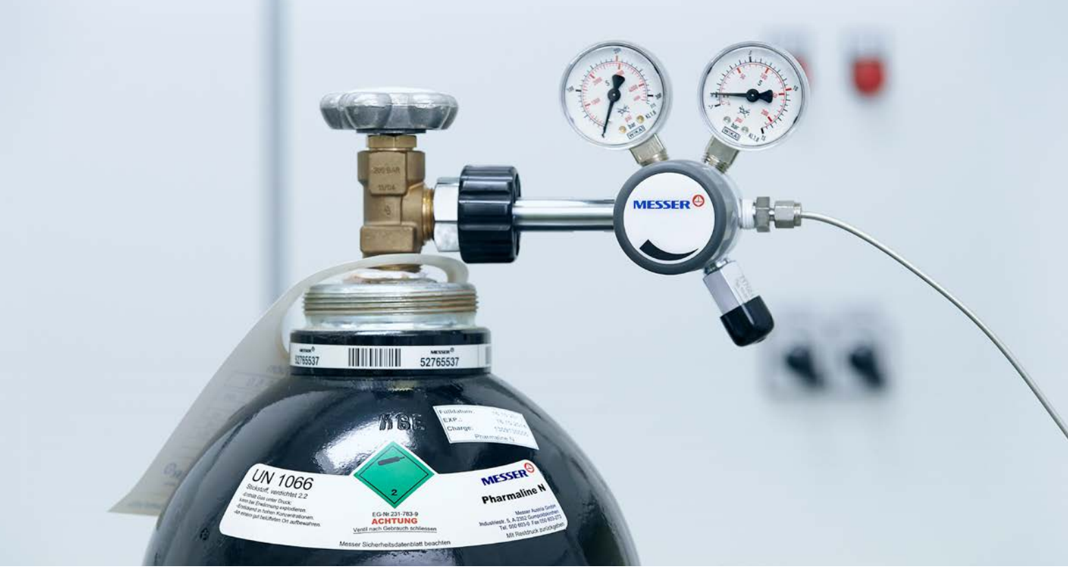
Individual cylinder at the point of use with cylinder pressure regulator