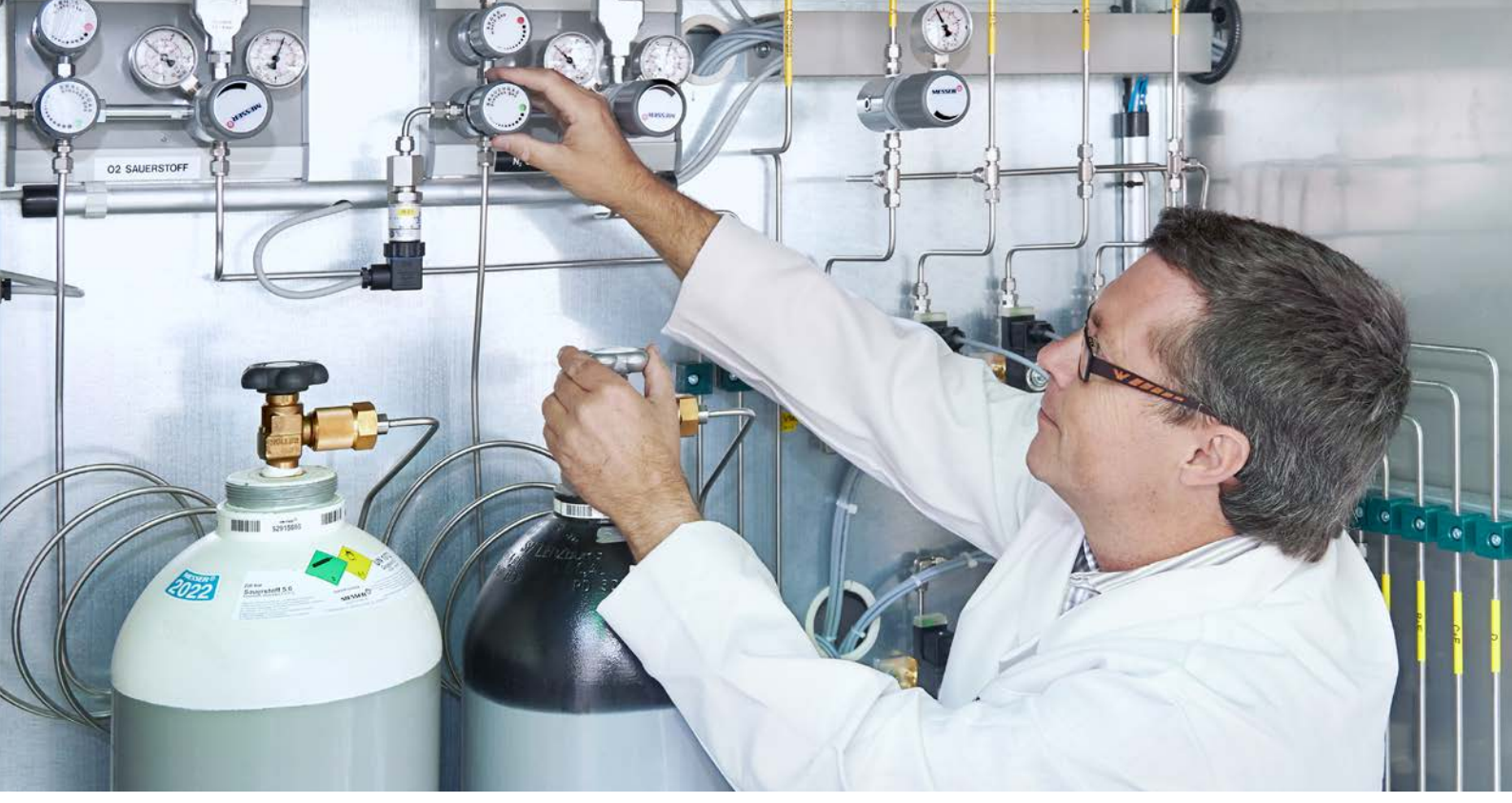
Central gas supply system